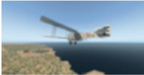
St Exupery's plane